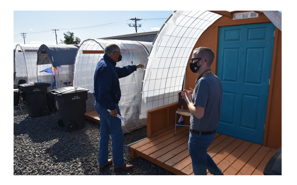
The <u>Walla Walla Alliance for the Homeless</u> Sleep Center provides a safe place for nearly half of the valley's unsheltered homeless population. On most nights, about 45 people find respite there.

As of October, a high number of Washington households – over 80,000 – reported they were likely facing eviction or foreclosure in the next two months, according to the Census Bureau Household Pulse survey. Meanwhile, due to social distancing requirements to prevent the spread of COVID-19, local shelter capacity has been squeezed.