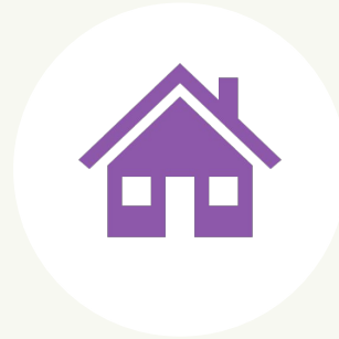
Barriers to affordable housing