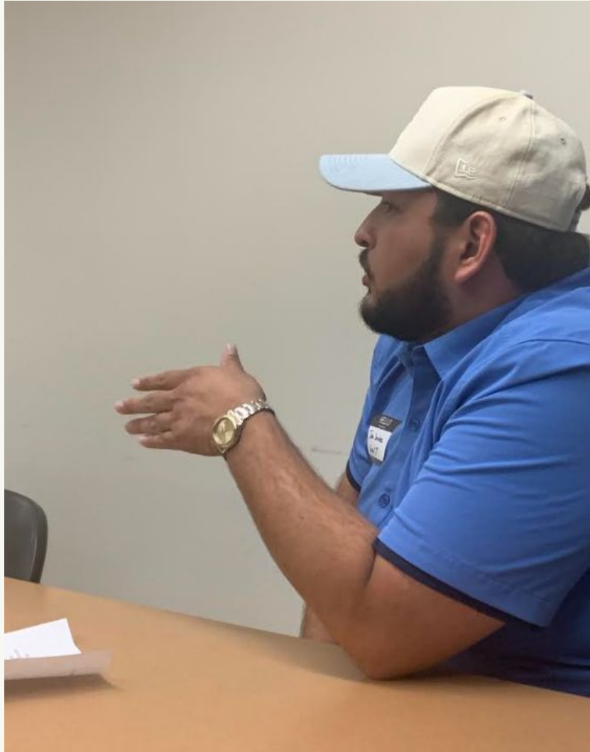
Image credit: MLK Labor leads a Community Assembly in Seattle on the effects of extreme weather events.