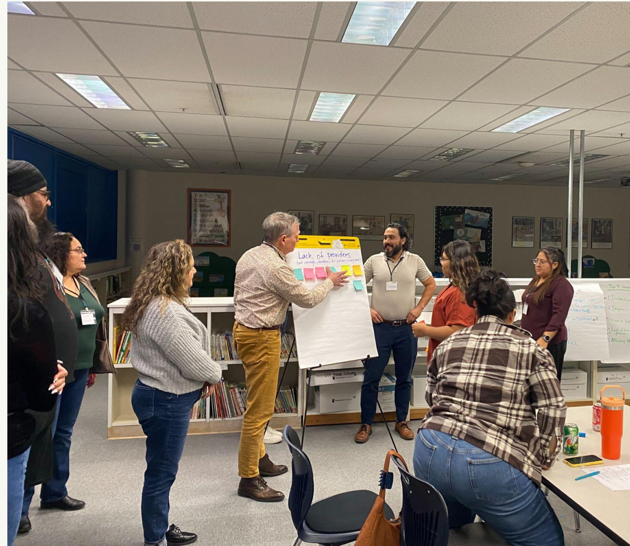
Community Assembly Participants discuss mental health resources in Walla Walla