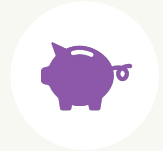
Unemployment & Low Wages

Facing environmental and economic challenges has given community members valuable wisdom and expertise.