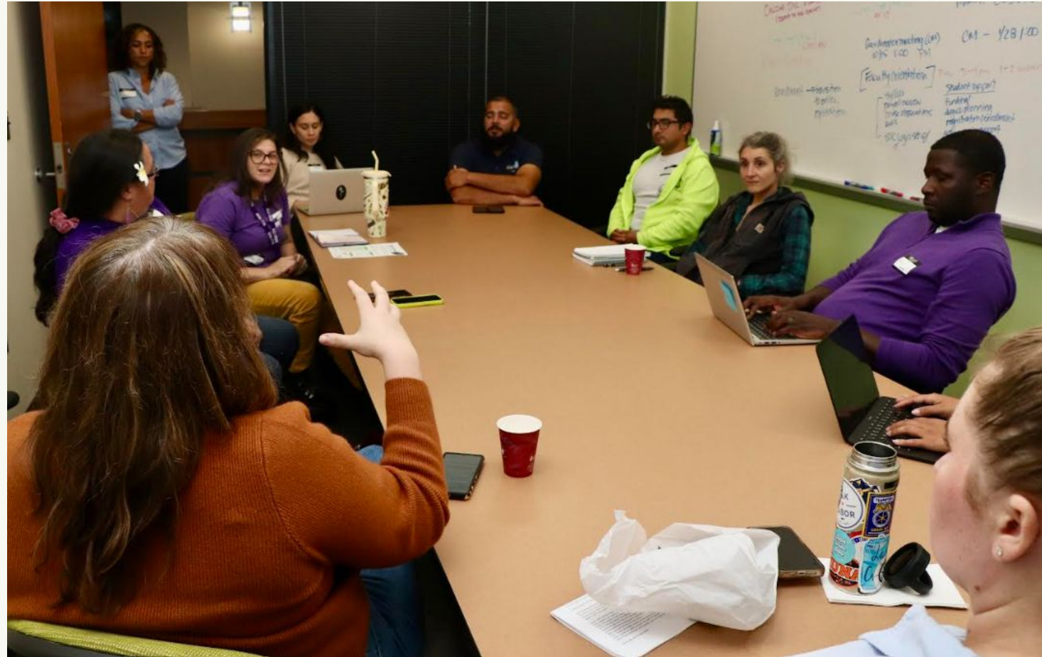
Image credit: MLK Labor leads a Community Assembly in Seattle on the effects of extreme weather events.

When communities participate in creating policy through collaborative governance, they are building skills in civic participation – and making Washington more resilient to economic and environmental challenges.